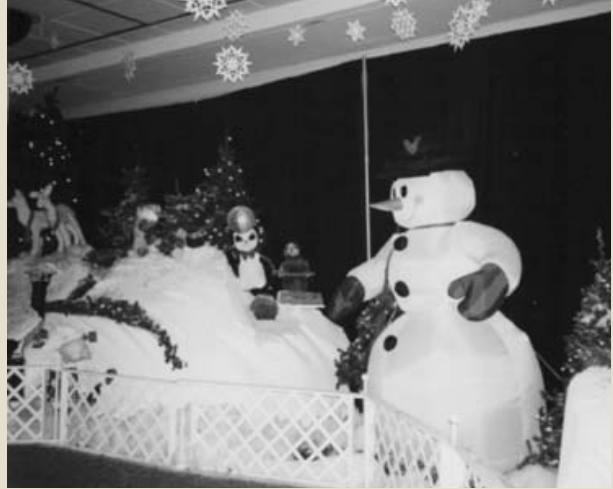
Enchanted Forest Festival of Trees

Now through Jan. 4, 2004 — Enchanted Forest Festival of Trees . Get into the Holiday spirit as you stroll through this magical winter wonderland on display in the Bodine Exhibit Hall and on the mezzanine of the Pink Palace Museum. Walking through the Enchanted Forest , children of all ages will be charmed by the animated characters. Teddy bears beckon, and elves are busy at work as penguins play in the snow and thousands of twinkling lights dazzle your youngster. Proceeds from this year's Enchanted Forest will benefit the cardiovascular services department at Le Bonheur. Admission is $5 for adults and $4 for seniors and children (ages 3-12). Group rates are available. For more information, call (901) 320-6362.