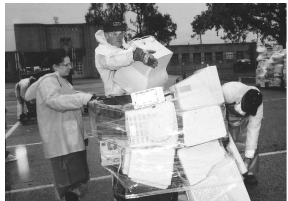
Public Works employees place computers and other discarded recyclable electronics on pallets.

Despite steady rain, Memphians turned out in record numbers to discard their household chemicals, paints, and electronics at the household hazardous waste collection event held November 15 in the Liberty Bowl parking lot. Hosted by City of Memphis Public Works and sponsored by the Tennessee Department of Environment and Conservation, the event far exceeded last year’s collection event.