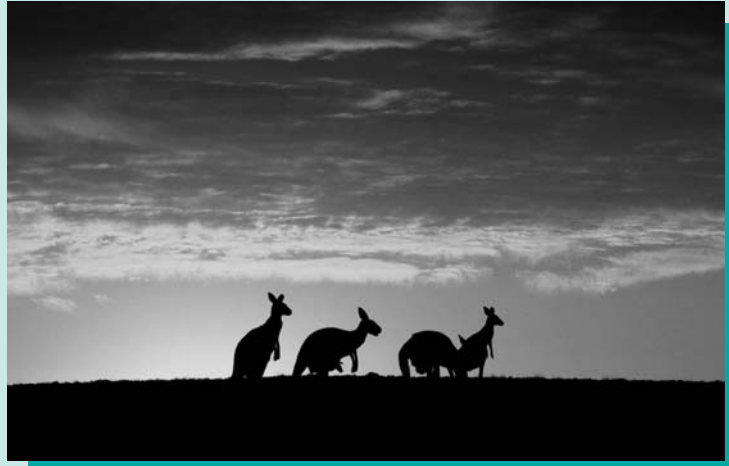
Australia: Land Beyond Time

Admission to this film is $7.50 for adults, $7 for seniors and $6 for children (ages 3-12). Group rates are available. For general IMAX information, call (901) 763-IMAX. For tickets and reservations, call (901) 320-6362.