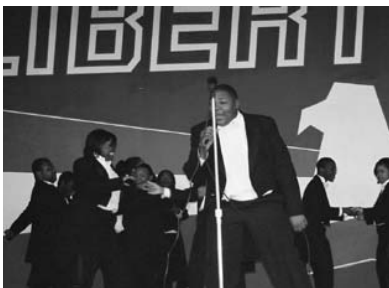
Yo! Memphis Show Choir performed at last year’s employee appreciation day and will return this year.